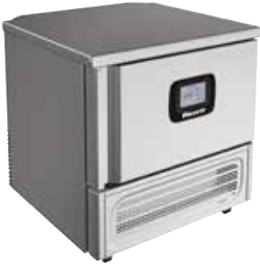
FBC-5T-RH, 5 tray