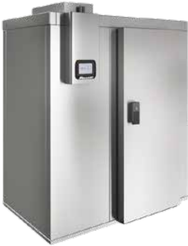
FBC-20T-RH, 1 trolley (cabinet)