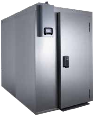
FBC-40T-RH, 2 trolley (cabinet)