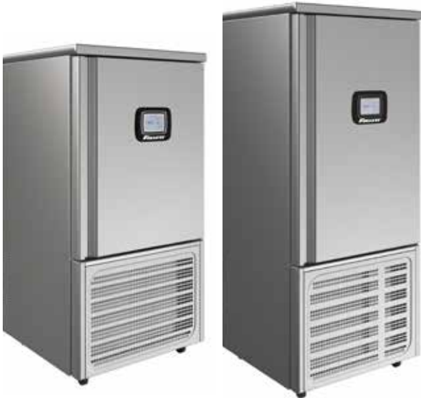
FBC-10T-RH, 10 tray