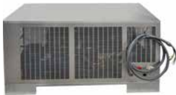
Remote condenser unit (included, assembly required)