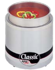
RW-2V with optional inset