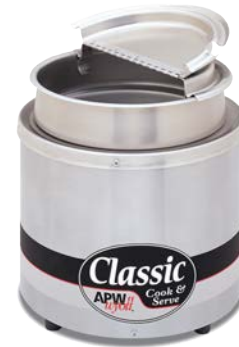
RCW-11 with optional inset, hinged lid

High performance, fast recovery design that is perfect for re-thermalizing refrigerated soup, stews, chili or other food products served out of a round inset. Thermostatically controlled heat system provides fast heat up and recovery. Exterior and interior constructed of stainless steel. If shipping via air freight, dimensional weights apply. FOB APW Dock, freight class 100.