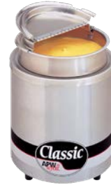
RW-1V with optional inset, hinged lid

Energy Efficient design that keeps hot food at the perfect serving temperature. Designed to run with water. Available in 7 quart and 11 quart versions. Made of stainless steel in the exterior and interior. Fully insulated to protect interior controls. SP designates soup package that includes inset, hinged cover and ladle. If shipping via air freight, dimensional weights apply. FOB APW Dock, freight class 100.