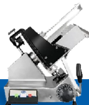
SG213 Advanced Manual