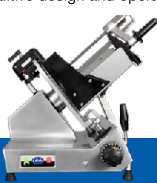
S213 Standard Manual

Use the chart below to find your perfect slicer by matching the model to the features you need. The S213 offers the most basic slicing without sacrificing quality cuts while the SG213A offers the most intuitive design and operator protection.