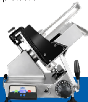
S213A Standard Automatic