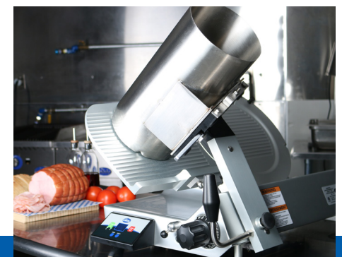
Slicer with Food Prep Attachment