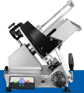
SG213A Advanced Automatic