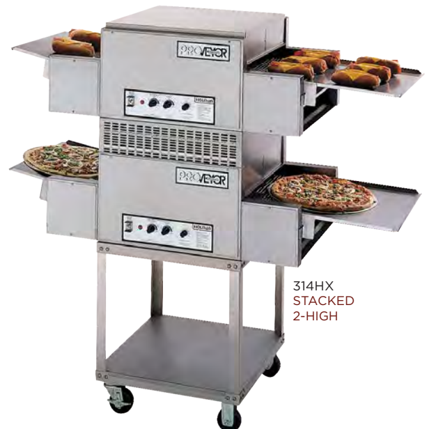
314HX STACKED 2-HIGH