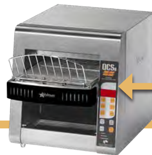
model with ELECTRONIC CONTROLS QCSe2-600H