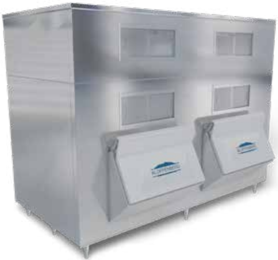
model# 4345 shown