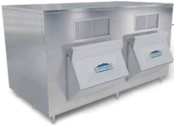
model# 2845 shown