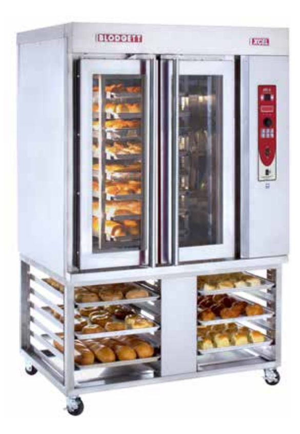
XR8-E with 12 pan stand