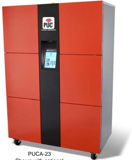
PUCA-23 Shown with optional custom colors