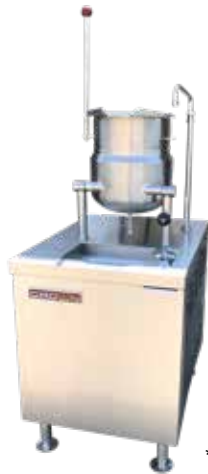
*Not as shown.