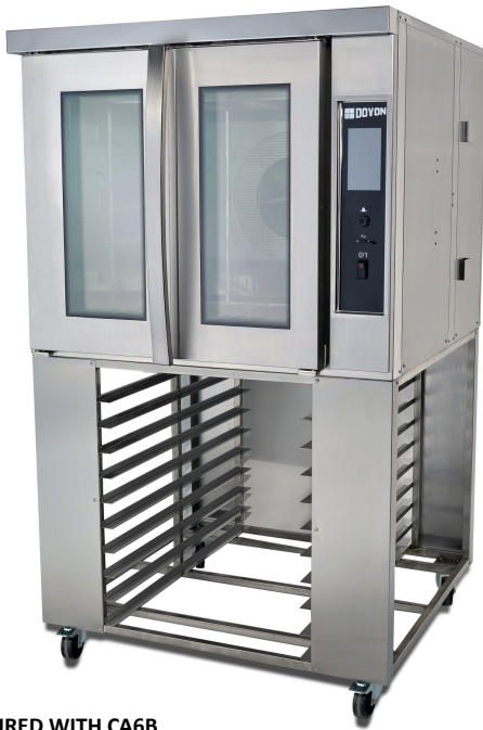
*PICTURED WITH CA6B