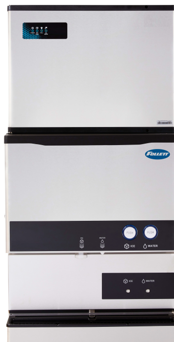
Pictured with a 30-inch modular cube ice machine on top