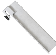
S2-FF300 High Food Fence (12.125" x 3.00")