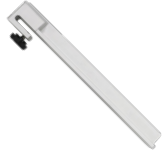
S2-FF125 Low Food Fence (12.125" x 1.125")