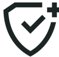
S-XDSLIM Extended 3-Year Warranty