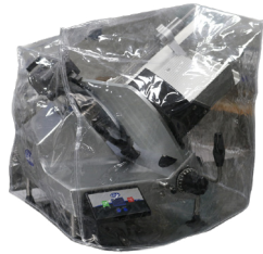
SC-LARGE Slicer Sanitation Cover