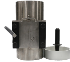
S2-FPA Food Prep Attachment (14.00" x 7.76")