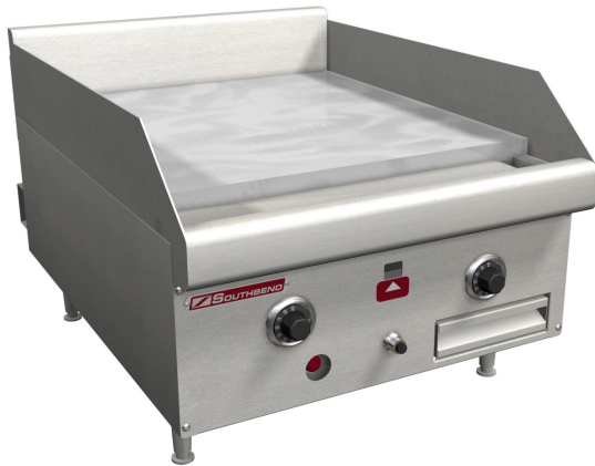
Model shown Model HDG-24