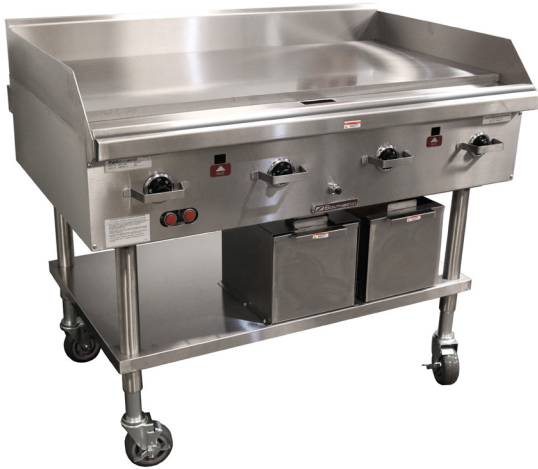
Model shown HDG-48V