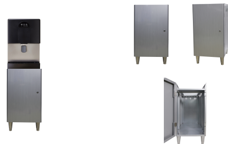
IDS-350 Stand (option) shown with ID-0160-AN