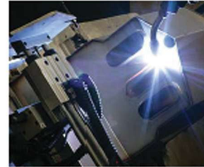
Robotic welding is precise, virtually eliminating leaks.