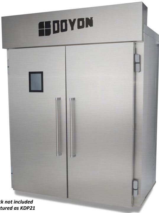
*rack not included *pictured as KDP21