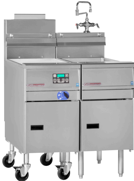
NOD14 / NODR14 (Pasta Cooker and Rinse Station Sold Separately)