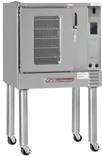
(PCHE75S/T shown with optional legs/casters)