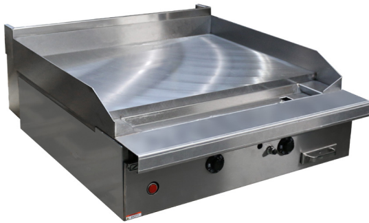
Model P32N-TT shown

** MANUAL GRIDDLES DO NOT ALLOW SPECIFIC TEMPERATURE OPERATION **