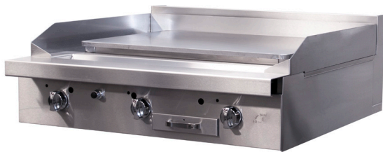
Model Shown P36N-PPP

** PLANCHA UNITS DO NOT ALLOW SPECIFIC TEMPERATURE OPERATION **