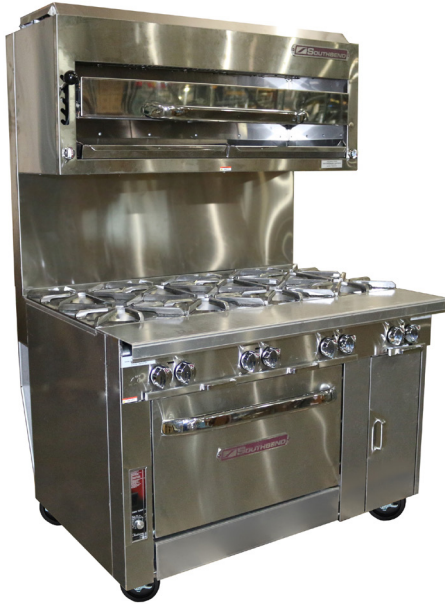
Model P48A-BBBB shown with optional 48" Salamander and casters