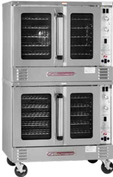
KLES/20SC shown with optional casters