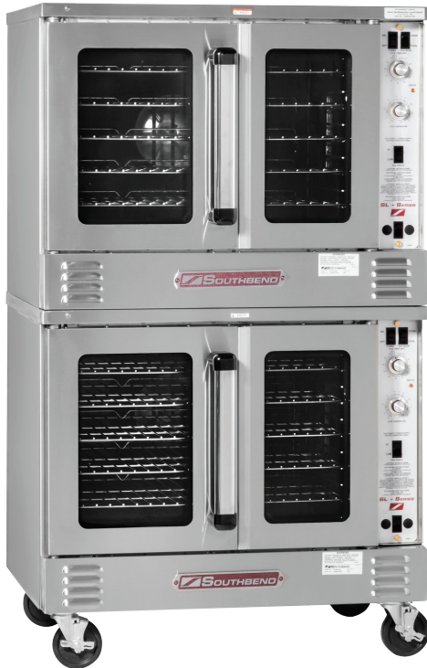
SLES/20SC shown with optional casters