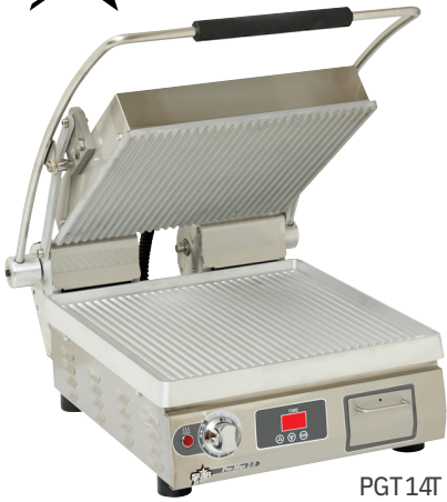
PGT14T [new models will utilize a different label design]