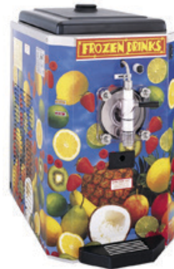
Shown with optional decals