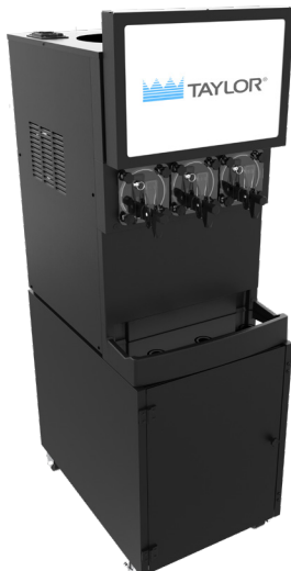
Shown with Optional Cart