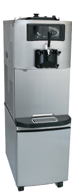
Optional Cart with front opening door

Protects the operator from injury as the beater will not operate without the dispensing door in place.