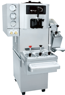
Optional Cart with rear door for front mount syrup rail