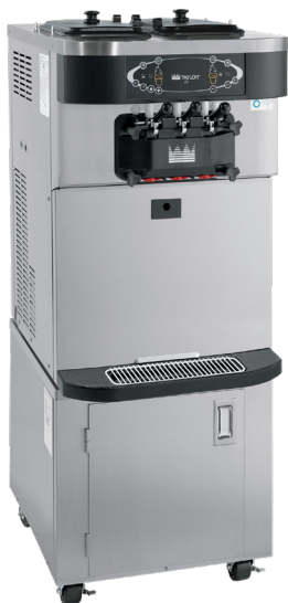
Shown with optional standard height cart