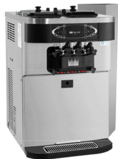
Optional top air discharge chute