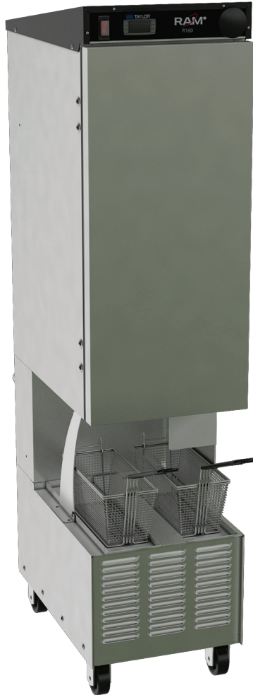
Fryer Baskets Sold Separately