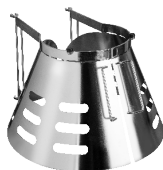
VPGUARD-150-ERGO 150 qt. SST partially shielded bowl guard set