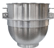
VBOWL-150-ERGOBRKT 150 qt. SST bracketed bowl compatible with MaxiLift