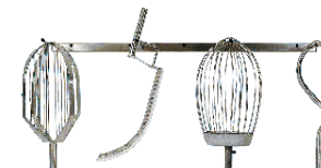
VTOOLRACK60-150 60-150 qt. tool rack