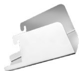
VCHUTE SST ingredient chute