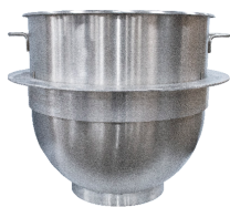
VBOWL-150-ERGO 150 qt. SST bowl