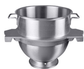
VBOWL80-150 80 qt. SST bowl