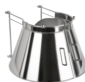
VFGUARD-150-ERGO 150 qt. SST fully shielded bowl guard set