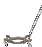
VBTRUCK-150-ERGO 150 qt. bowl truck