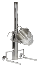
VLIFT-M150H 150 qt. bowl lift