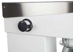
Side-mounted #12 attachment hub